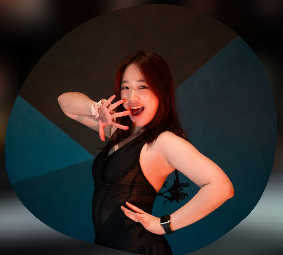
Choreographer: Perilous Love